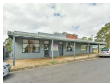
Bargo 1 209 Great Southern Road

SHOP IN PRIME LOCATION This shop is approximately 103.3 sqm, is conveniently located in the heart of Bargo with good exposure and is occupied by long term tenants. Currently.. Sue Rosella 02 46771488 Alyssa Houston (02) 4677 1488