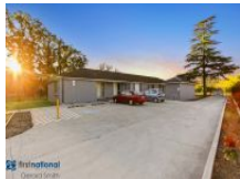
Picton 6/10 Menangle St W