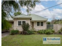
Yanderra 30 Chandos Rd

THREE BEDROOM HOUSE WITH 1 BEDROOM FLAT ON 2 ACRES Be quick to inspect this large property located on a quiet street. Yanderra is situated on the fringes.. Sue Rosella 02 46771488 Alyssa Houston (02) 4677 1488