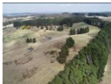
Marulan 15086 Hume Hwy

LARGE 50 ACRE RETREAT WITH COUNTRY STYLE HOUSE AND HUME HIGHWAY ACCESS Features include;• Boundary Fencing• 4 Internal Paddocks• 2 Dams• Water Tanks• Bore• Small Sheds/Outbuildings•.. Sue Rosella 02 46771488 Alyssa Houston (02) 4677 1488